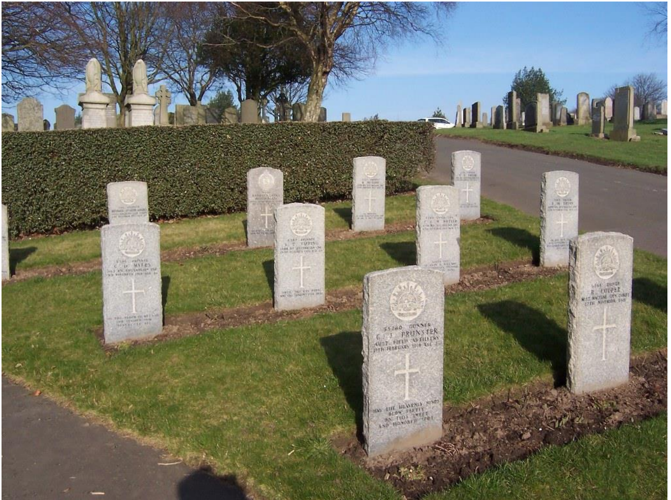
Some of the Australian Headstones in Western Necropolis Cemetery, Glasgow, Scotland